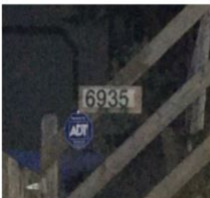
Without Reflective Address Sign

Add $1.00 for post mounting brackets / Add $5.00 for ground mounting T post