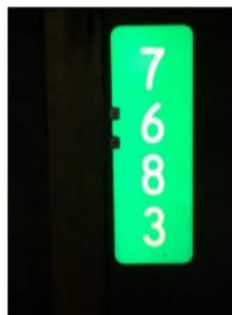
With Reflective Address Sign

Contact David Manske at (530) 295-9089 for more information and to order your sign!